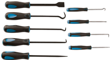
Pick Hook and Scraper Set 9pc | 6382